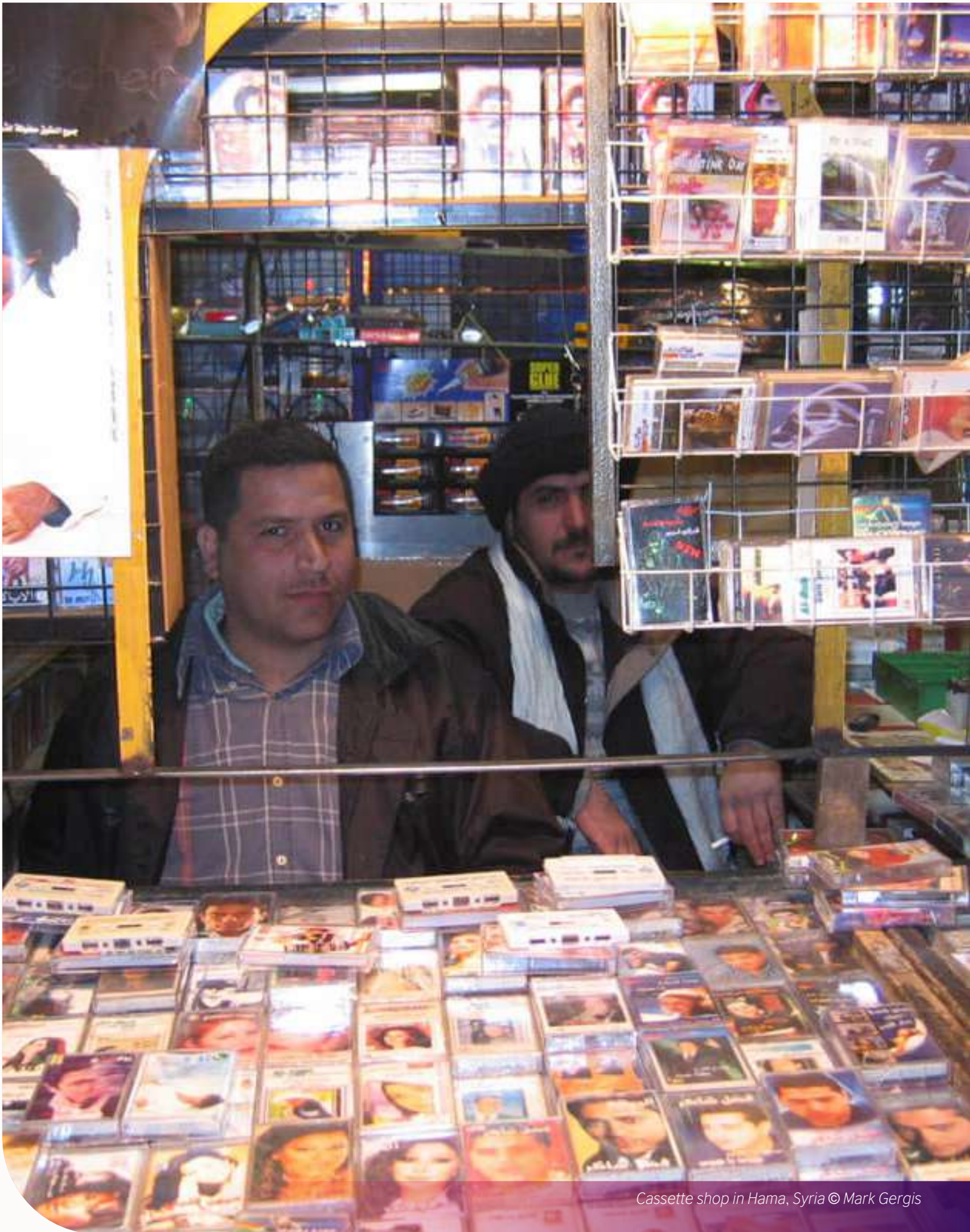
Cassette shop in Hama, Syria