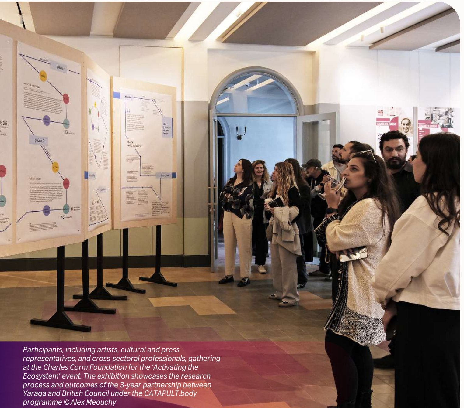
Participants, including artists, cultural and press representatives, and cross-sectoral professionals, gathering at the Charles Corm Foundation for the 'Activating the Ecosystem' event. The exhibition showcases the research process and outcomes of the 3-year partnership between Yaraqa and British Council under the CATAPULT.body programme