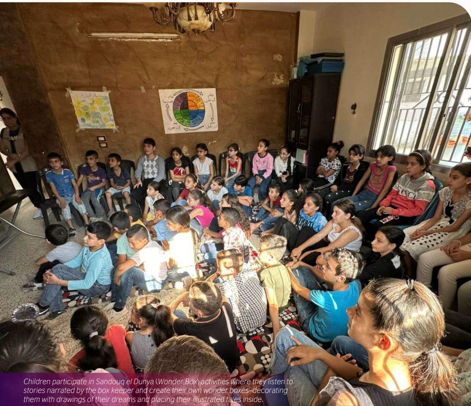
Children participate in Sandouq el Dunya (Wonder Box) activities where they listen to stories narrated by the box keeper and create their own wonder boxes—decorating them with drawings of their dreams and placing their illustrated tales inside.

Grant recipient(s): Ettijahat – Independent Culture | Partner(s): Action for Hope | Grant Amount: £ 110,000 | Target Country: Syria