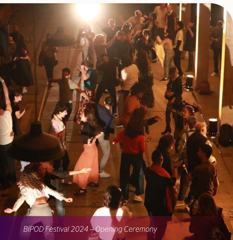
BIPOD Festival 2024 – Opening Ceremony

Accessibility and sustainability were central to the 2024 edition, with efforts made to integrate both local cultural landmarks and digital platforms to bridge physical and virtual spaces. The festival supported emerging artists while fostering international collaboration, pushing the boundaries of dance through the inclusion of various art forms like music, visual arts, and literature. The participatory format of the festival allowed the audience to immerse themselves in the performances, with opportunities to engage in improvisations, collaborative activities, and cultural encounters that highlighted the strength of community in shaping the experience.