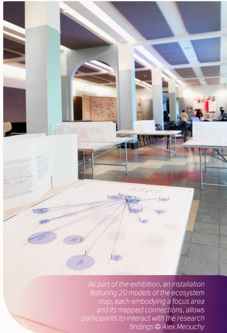
As part of the exhibition, an installation featuring 20 models of the ecosystem map, each embodying a focus area and its mapped connections, allows participants to interact with the research findings

The research underpinning the platform's development was comprehensive, identifying 20 critical areas, 123 key topics, and 412 connections within the D&M ecosystem. It illuminated essential dynamics, such as financial sustainability, regional disparities, and professional work patterns, while highlighting opportunities to strengthen the sector. These findings have become the foundation for informed decision-making, empowering stakeholders to design effective interventions while fostering cross-disciplinary collaboration. To further disseminate these findings, the Activating the Ecosystem event featured an installation pre-launch that transformed the research into a tangible, visual experience. Detailed installations presented the ecosystem's critical areas and interconnections in an accessible format,