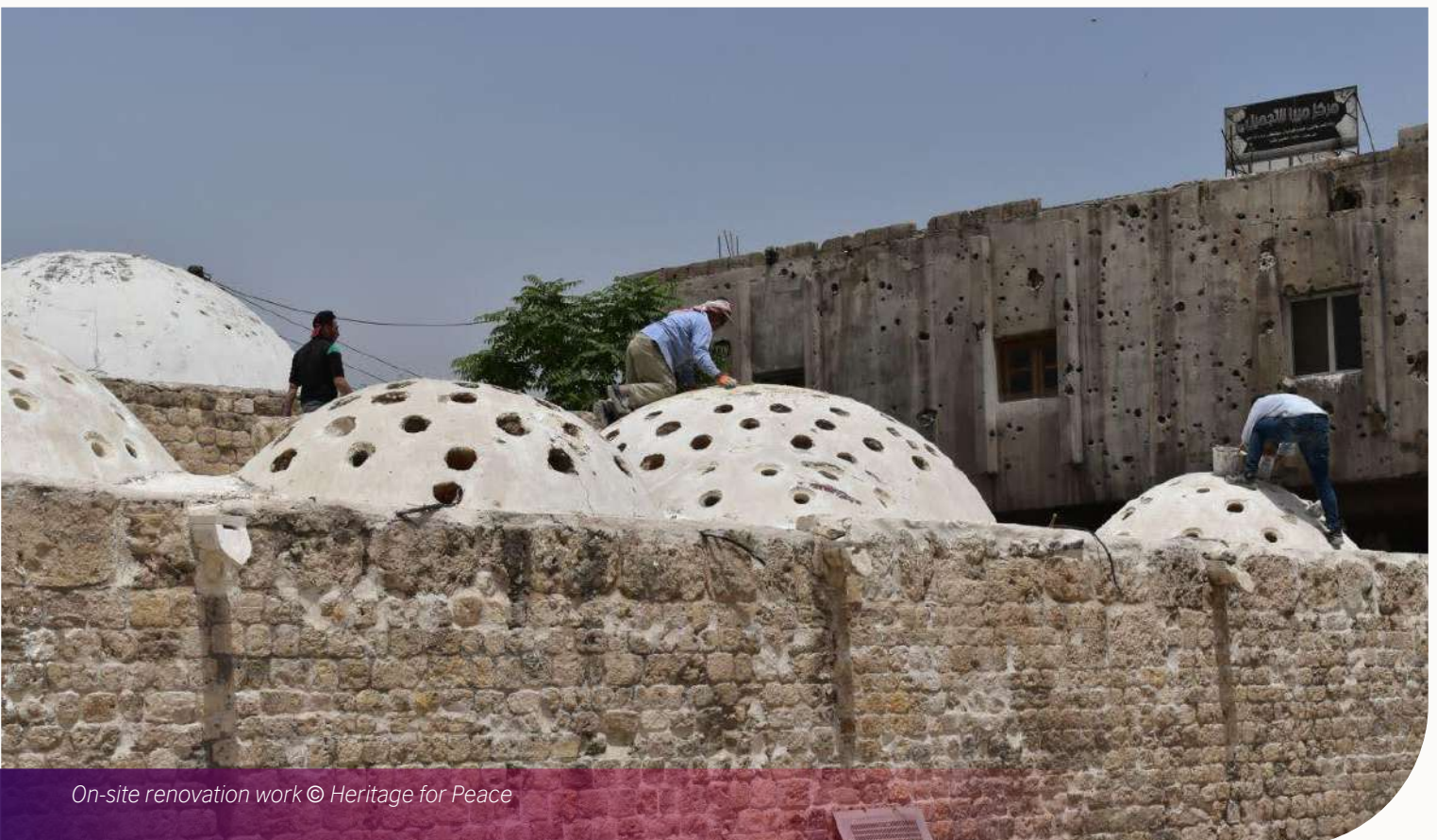
On-site renovation work

Success factors included comprehensive training workshops covering all aspects of heritage documentation, which involved 15 local trainees, 35 workers, and 17 artisans. Training in heritage management and consolidation resulted in emergency interventions which effectively stabilized and safeguarded key monuments, while community outreach efforts organized heritage lectures and events, promoting cultural understanding. The project also identified and developed heritage-based economic opportunities through exploring the potential for future tourism.