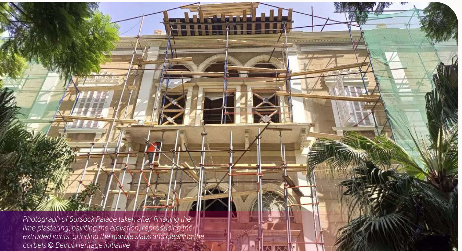
Photograph of Sursock Palace taken after finishing the lime plastering, painting the elevation, reproducing the extruded joints, grinding the marble slabs and cleaning the corbels

The project encompassed a series of critical restoration measures. Structural reinforcement involved consolidating wall-to-wall and wall-