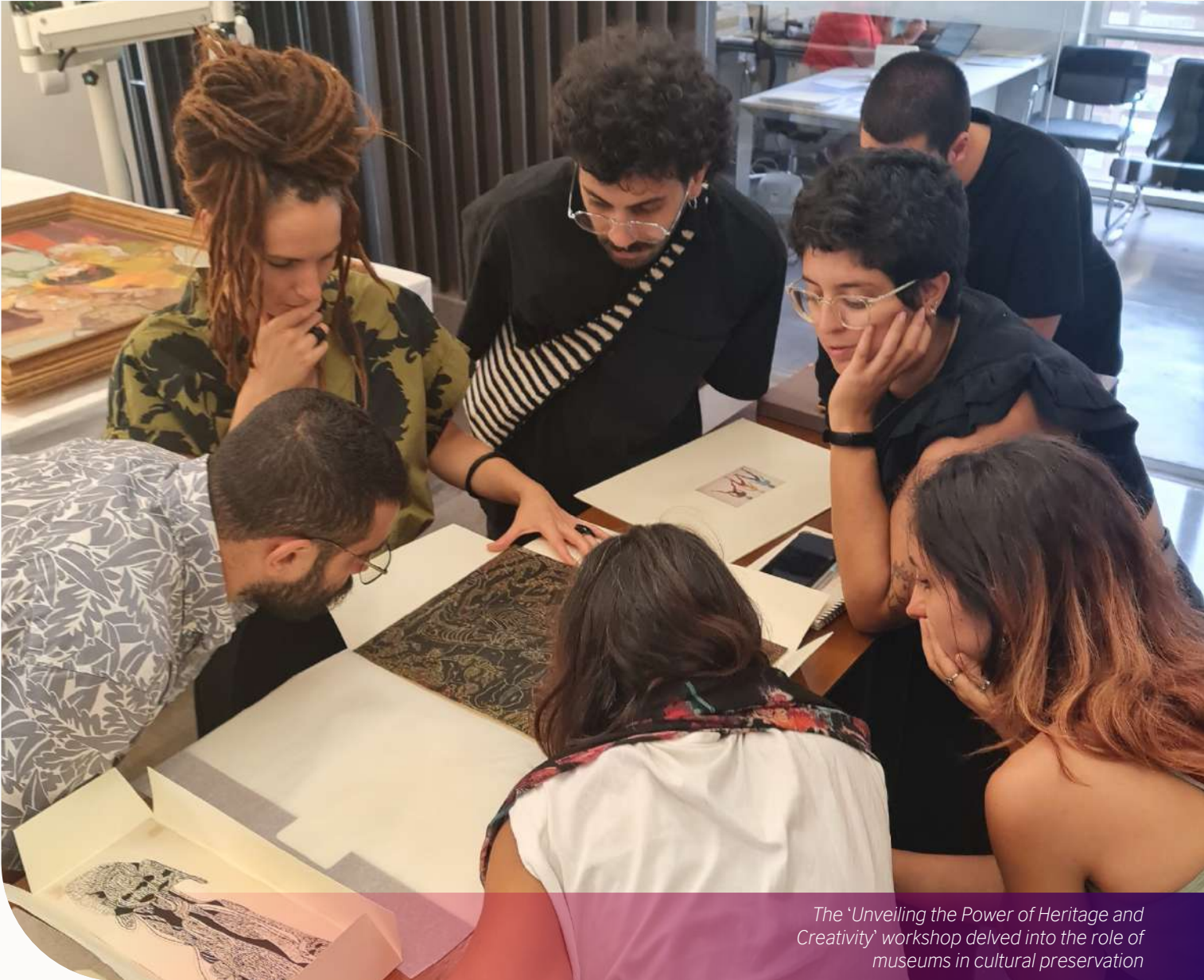
The 'Unveiling the Power of Heritage and Creativity' workshop delved into the role of museums in cultural preservation

activism, sustainability, and entrepreneurship. Participants engaged in inspiring discussions with experts, delving into topics such as heritage preservation, digital artistry, exhibition design, and sustainable creative practices. These workshops not only broadened the participants' knowledge but also equipped them with tools and insights for navigating the complex landscape of the arts and culture sector.