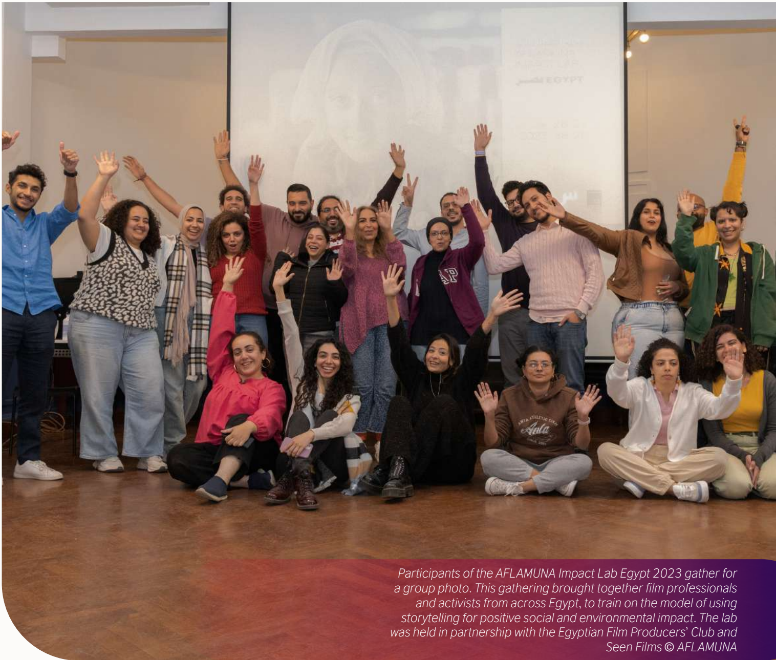
Participants of the AFLAMUNA Impact Lab Egypt 2023 gather for a group photo. This gathering brought together film professionals and activists from across Egypt, to train on the model of using storytelling for positive social and environmental impact. The lab was held in partnership with the Egyptian Film Producers' Club and Seen Films

A key strength of the project was its commitment to inclusivity. The program not only included diverse participant profiles, but it also created safe spaces for discussions on sensitive topics such as gender equality and queer rights. Many of the films produced through the labs have become powerful tools for advocacy, shedding light on issues like forced circumcision, child labour, and transgender rights. One of the major impacts of the AFLAMUNA project was its ability to open new professional avenues for participants, particularly the creation of the role of Impact Producers. These professionals bridge the gap between filmmaking and civil society, ensuring that films not only reach their intended audiences but also create meaningful, lasting change. In Egypt, Seen Films