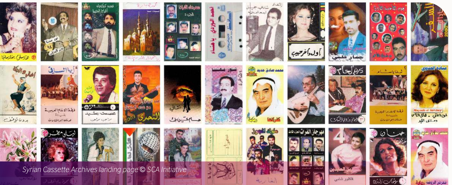
Syrian Cassette Archives landing page

The fund also supports training in digitization and collection documentation, fostering local expertise to sustain this preservation effort. Crucially, the Syrian Cassette Archives captures the stories behind the music through interviews with musicians, producers, and collectors, creating a living archive that connects past and present. These interviews offer invaluable insight into Syria's cultural history and the importance of music within the country's communities. By making these materials accessible online, the initiative not only preserves endangered heritage but also fosters cross-cultural understanding, ensuring Syria's artistic resilience and its contributions to global culture endure for future generations. This ongoing project creates a platform for the revival of forgotten voices, supporting the preservation of intangible heritage and contributing to the long-term recovery and cultural rebuilding of Syria.