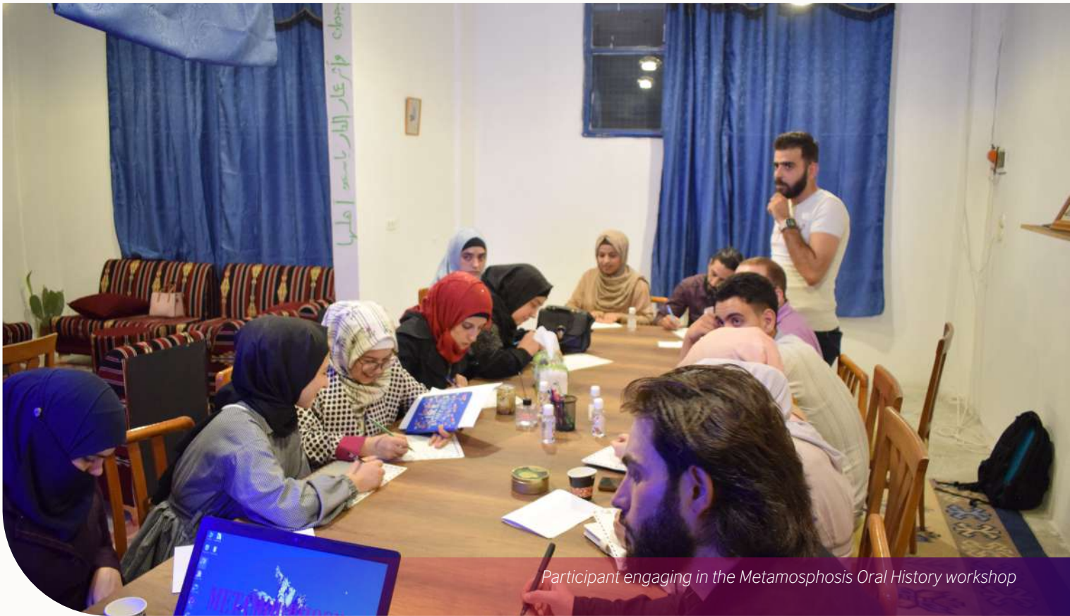
Participant engaging in the Metamorphosis Oral History workshop

In response to the devastating earthquake that struck northern Syria and southern Turkey in February 2023, Ettijahat – Independent Culture launched the Ahliyah initiative in partnership with Action for Hope. Named after the Syrian tradition of civic solidarity, Ahliyah mobilised a rapid emergency framework that delivered vital support to communities and cultural actors affected by the disaster.