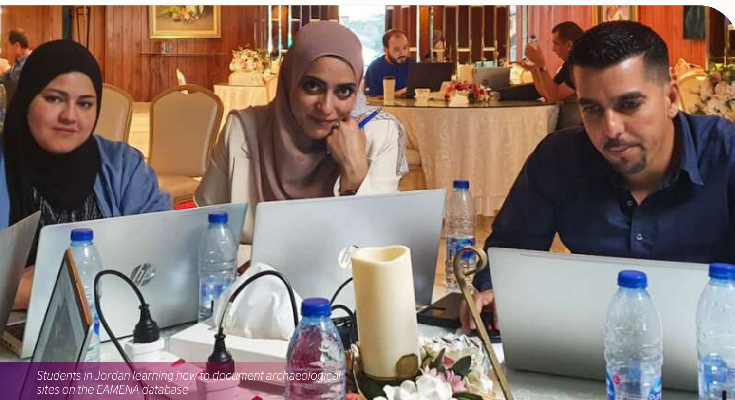
Students in Jordan learning how to document archaeological sites on the EAMENA database

This initiative focuses on enhancing local capacity and equipping heritage professionals with the digital tools needed to safeguard these irreplaceable assets. Central to the effort is the EAMENA database, an open-access platform that consolidates data from satellite imagery and published reports to provide a comprehensive view