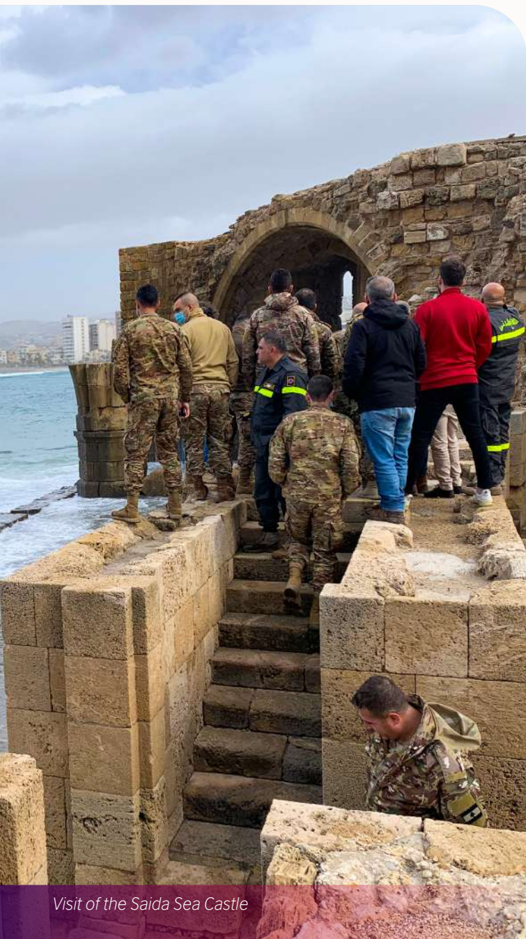
Visit of the Saida Sea Castle

Jouhouzia, a training program dedicated to protecting cultural heritage in times of crisis, has received support from the Cultural Protection Fund to strengthen the capacity of heritage and emergency professionals in Lebanon. In a country where cultural heritage remains at risk due to conflict and natural disasters, this initiative unites archaeologists, museologists, archivists, fire brigades, police officers, and army personnel, fostering collaboration between these diverse actors to enhance emergency preparedness and response.