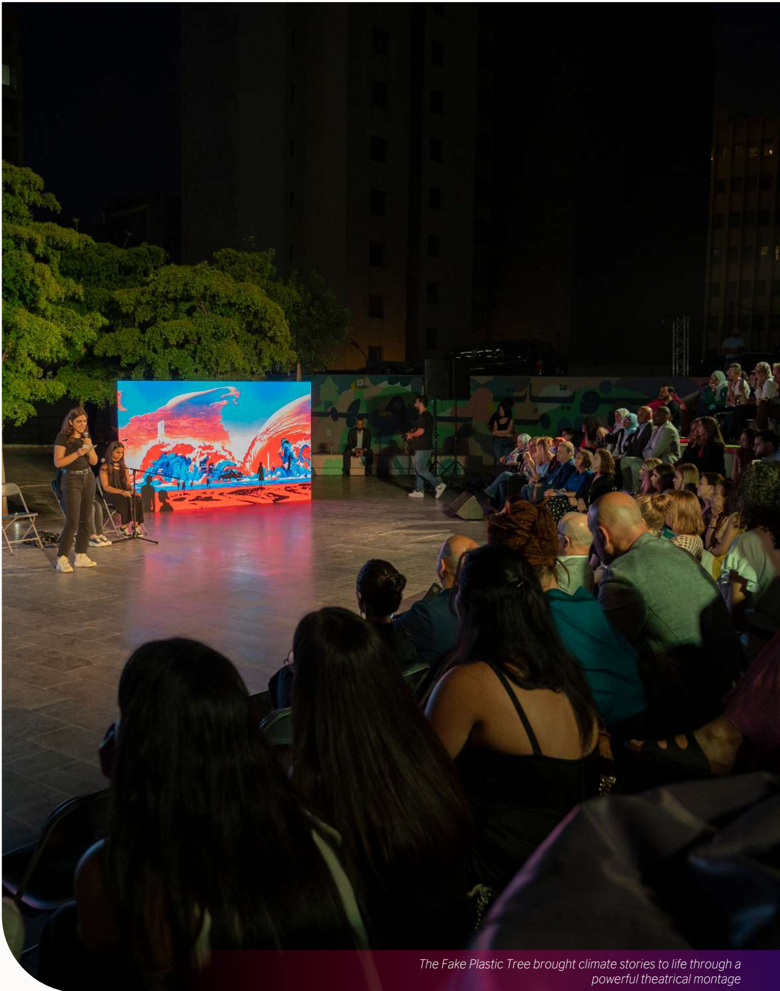
The Fake Plastic Tree brought climate stories to life through a powerful theatrical montage