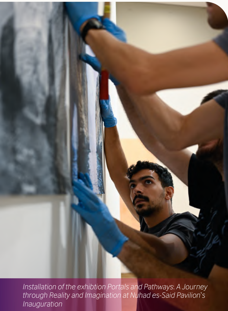
Installation of the exhibition Portals and Pathways: A Journey through Reality and Imagination at Nuhad es-Said Pavilion's Inauguration