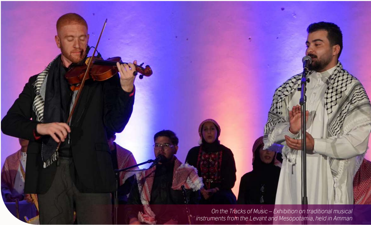
On the Tracks of Music – Exhibition on traditional musical instruments from the Levant and Mesopotamia, held in Amman

In the midst of conflict and displacement across Syria, Iraq, Lebanon, and Jordan, the rich musical heritage of the Levant and Mesopotamia faces grave threats. On the Tracks of Music , led by Action for Hope in collaboration with cultural organisations from across the region, aims to preserve and revive these endangered traditions while reconnecting communities through music.