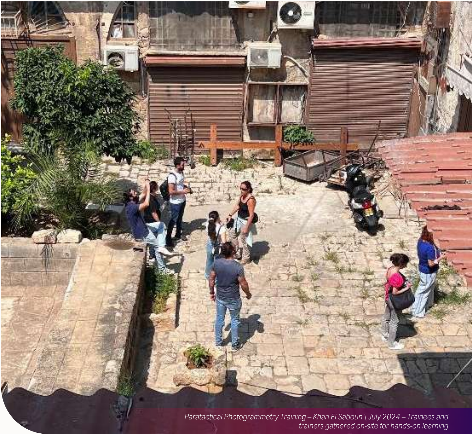
Paratactical Photogrammetry Training – Khan El Saboun \ July 2024 – Trainees and trainers gathered on-site for hands-on learning

creating a comprehensive digital record. In Batroun, 80% of the Old City was documented. Meanwhile, Tripoli's Old City, including Khan El Saboun, underwent extensive scanning. The collected data was transformed into orthophotographs and architectural documentation, providing a valuable resource for future restoration efforts. In addition, a structural assessment of eight zones in Tripoli was conducted from August 23 to September 23, 2024. Teams of volunteers, team leaders, and coordinators systematically surveyed historical buildings, prioritizing those at risk. Inaccessible structures were analysed externally, supplemented by resident interviews.