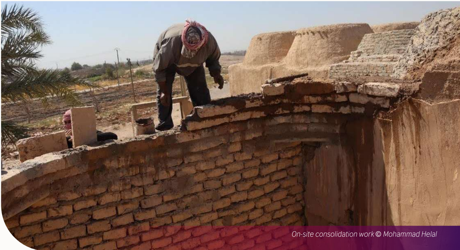
On-site consolidation work

Grant recipient(s): Asociacion RehabiMed | Partner: Heritage for Peace, Lebanon | Grant Amount: £ 97,500 | Target Country: Syria