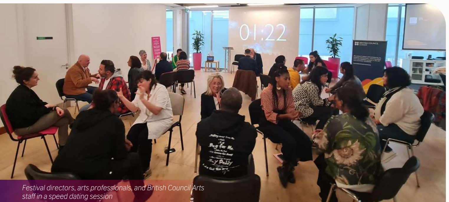
Festival directors, arts professionals, and British Council Arts staff in a speed dating session

The convening featured contributions from over twenty international festivals – including Shubbak (UK), Visa for Music (Morocco), Baghdad Tarkib (Iraq), Dougga Festival (Tunisia), Edinburgh Art Festival, and the Liverpool Arab Arts Festival – each presenting case studies that illustrated innovation and resilience in their respective contexts. Together, these exchanges underscored that festivals are not merely celebratory events but critical infrastructures for social connection, identity formation, and creative economies.