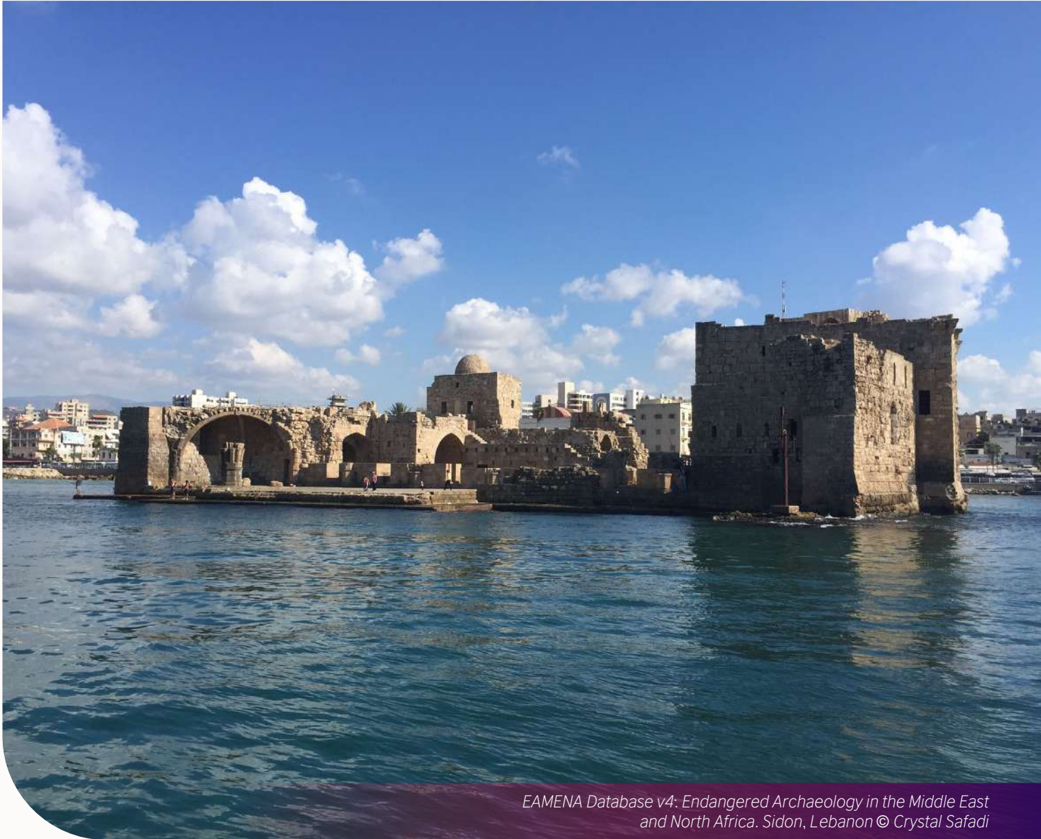
EAMENA Database v4: Endangered Archaeology in the Middle East and North Africa. Sidon, Lebanon

of at-risk sites. By tracking changes over time, the database enables timely monitoring and supports informed decision-making for site protection.