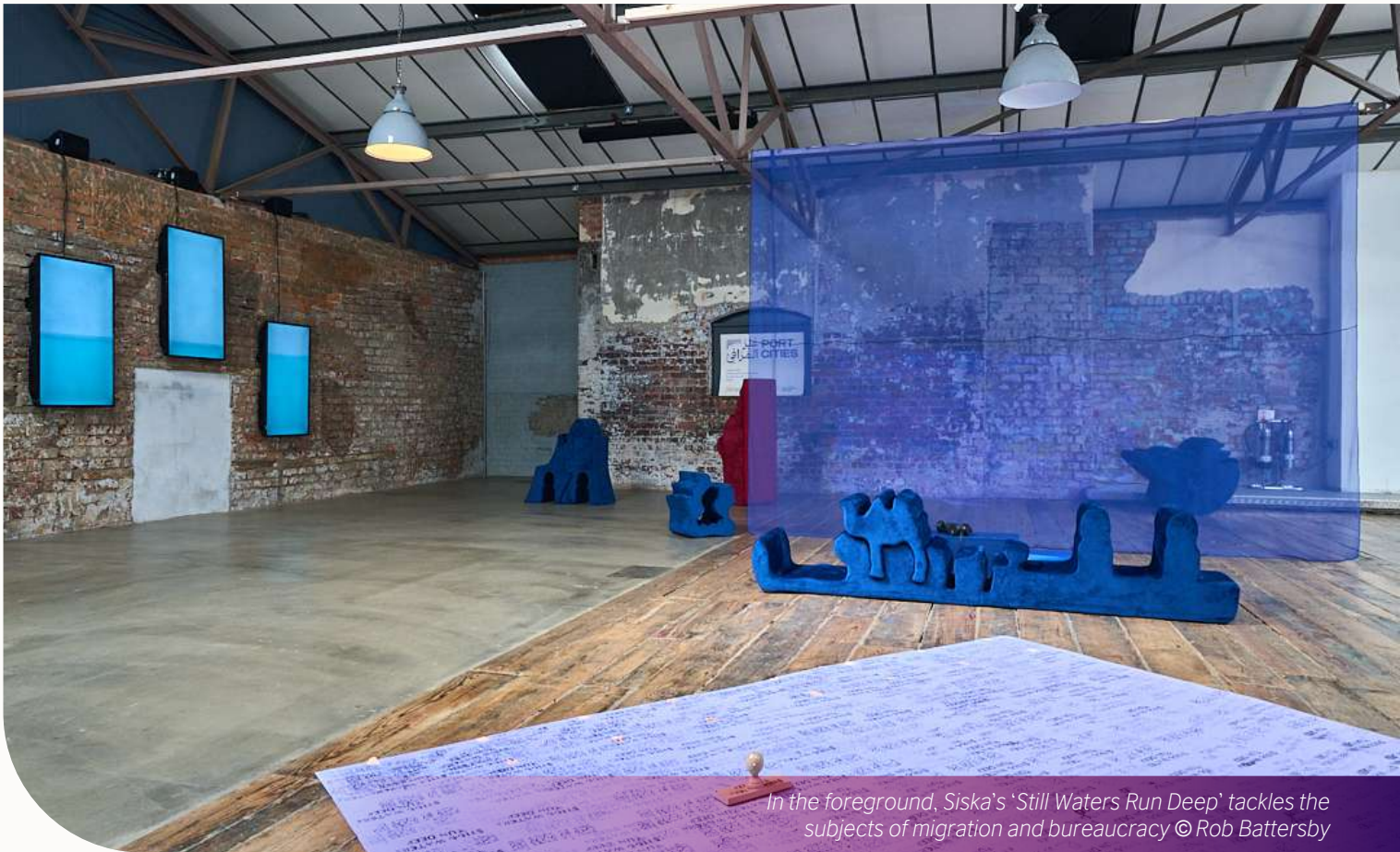
In the foreground, Siska's 'Still Waters Run Deep' tackles the subjects of migration and bureaucracy © Rob Battersby

to the sea and mythical creatures, critiquing humanity's exploitation of marine ecosystems for trade, war, and the commodification of human lives. Laila Hida's Reversed Landscape , an extension of her ongoing project Le Voyage du Pheonix , used Liverpool's iconic locations, such as Sefton Park's Palm House, to reflect on the displacement of commodities and the legacy of imperial exploration. Nadia Kaabi-Linke's Heartbeat Wavelines created a poignant link between Liverpool and Tunis through a site-specific installation. The piece combined a full-scale drawing of a derelict wall from Liverpool's North docks with windows from the Megara Hotel in Tunis, symbolizing shared histories of war, deprivation, and perpetual change. Siska, meanwhile, employed a mix of film and archival materials to examine the intersections of personal and collective memory, inviting audiences to consider how port cities like Beirut and Liverpool are shaped by migration and identity.