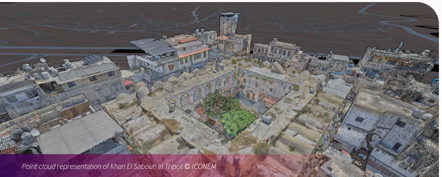
Point cloud representation of Khan El Saboun in Tripoli

Grant recipient: Iconem Fund | Partner: Lebanese Ministry of Culture - General Directorate of Antiquities (DGA), Lebanon | Grant Amount: £ 92,000 | Target Country: Lebanon