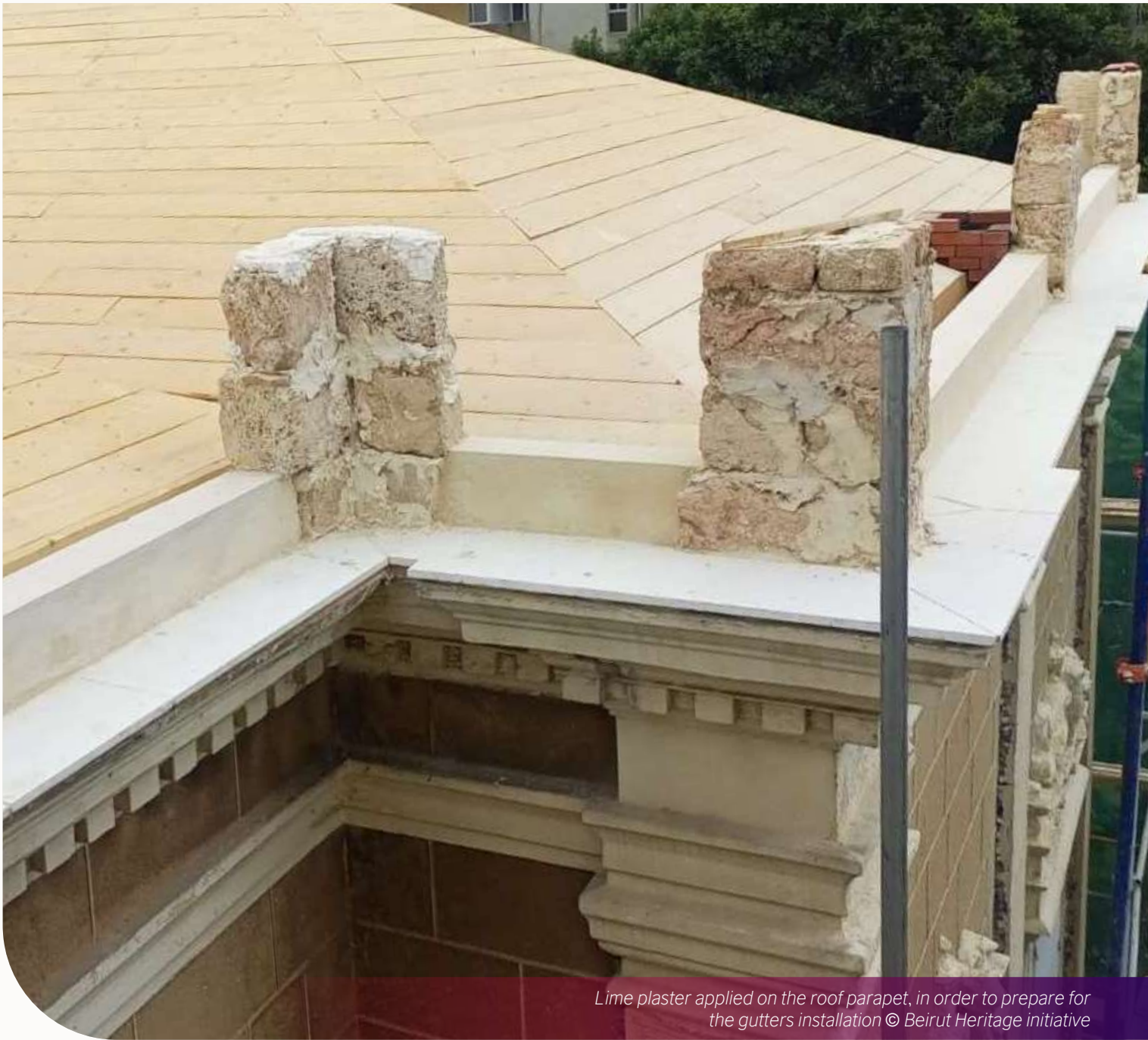
Lime plaster applied on the roof parapet, in order to prepare for the gutters installation

to-slab connections using stainless steel rods and plates to improve resilience against future stressors. Masonry restoration required the careful disassembly, documentation, and reconstruction of damaged stone elements, with special attention given to the reinstallation of decorative limestone pediments. The roof rehabilitation included replacing deteriorated wooden components and installing stainless steel gutters, copper chimney extensions, and a breathable vapor barrier beneath the red clay tiles. The restoration process also extended to interior plaster finishes, where structural fiber mesh reinforcement was applied before traditional lime plaster layers,