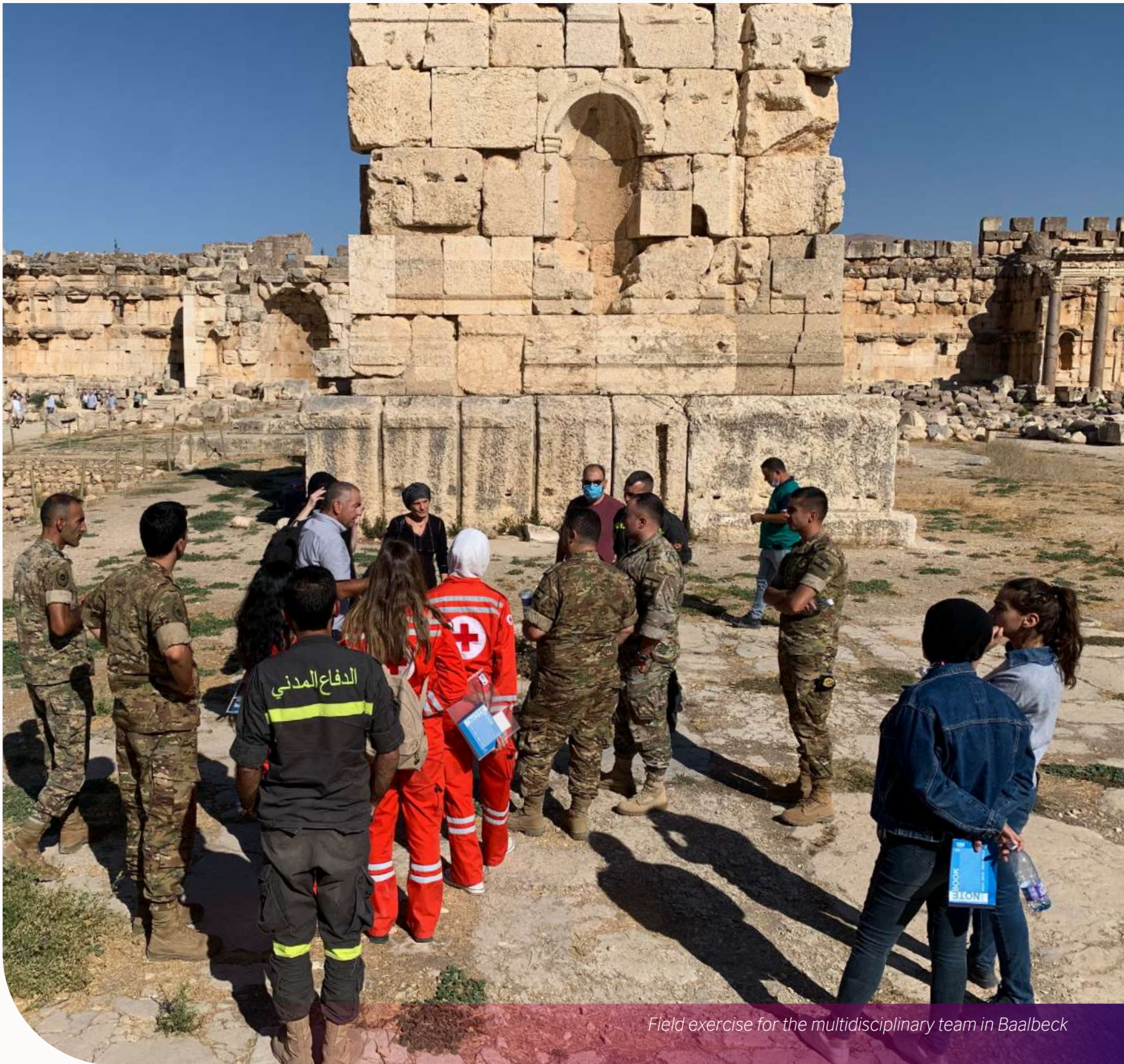
Field exercise for the multidisciplinary team in Baalbeck

headquarters in Jamhour, a facility equipped with a lecture hall and a dedicated simulation room designed to replicate a museum environment. This space enables trainees to practice real-world emergency response techniques, including object evacuation, triage, and first-aid conservation for cultural artifacts.