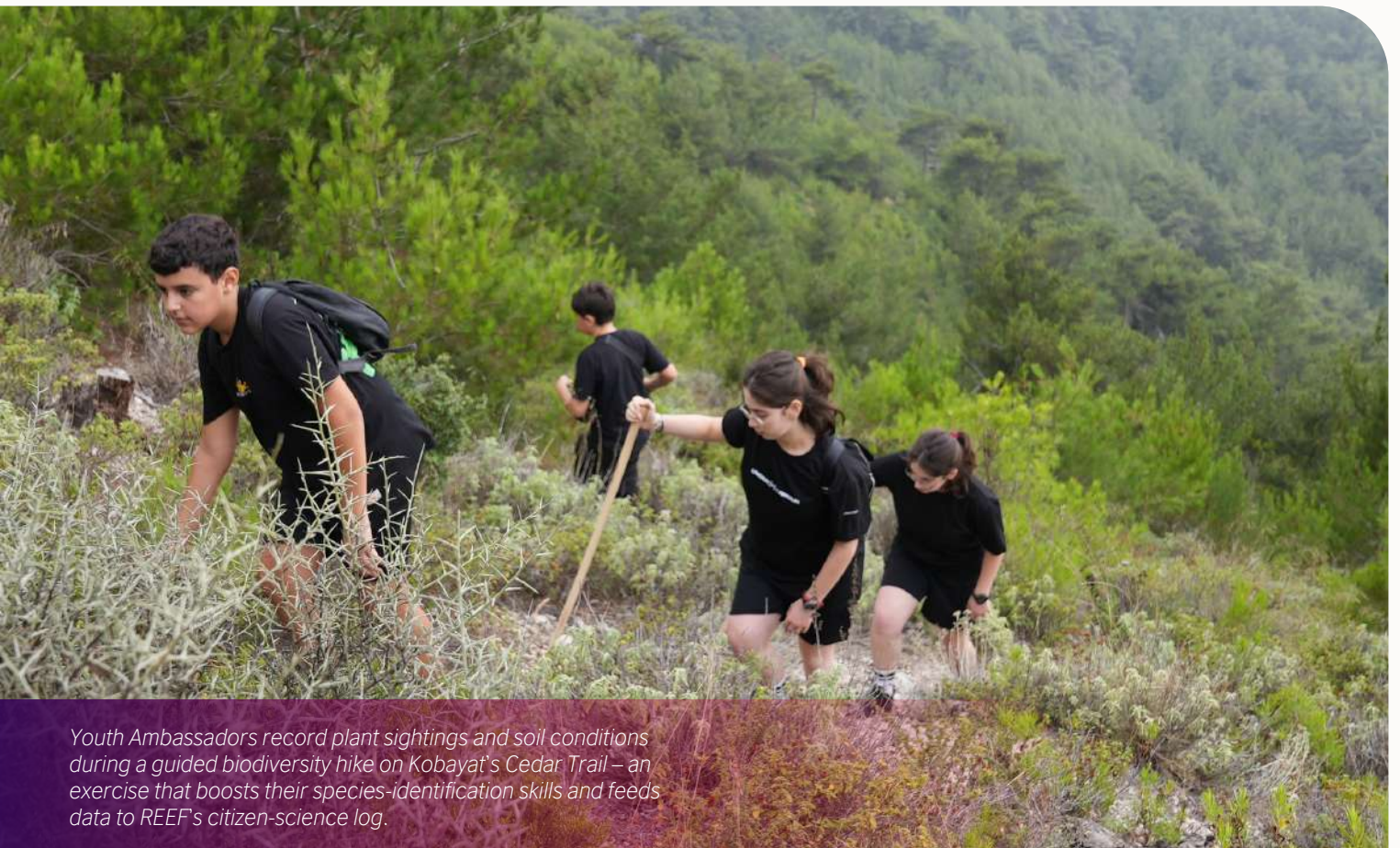
Youth Ambassadors record plant sightings and soil conditions during a guided biodiversity hike on Kobayat's Cedar Trail – an exercise that boosts their species-identification skills and feeds data to REEF's citizen-science log.

The evidence of this shift was clear. Baseline surveys showed most ambassadors could initially name only two local species; by the week's end, they identified at least ten and explained threats such as unchecked logging and spring-water contamination. Their new knowledge was formalised in a press communiqué—researched and presented on the festival stage—that urged municipal leaders to cut plastic use, monitor forest health and protect Mar Assia spring. Three neighbouring municipalities have adopted the