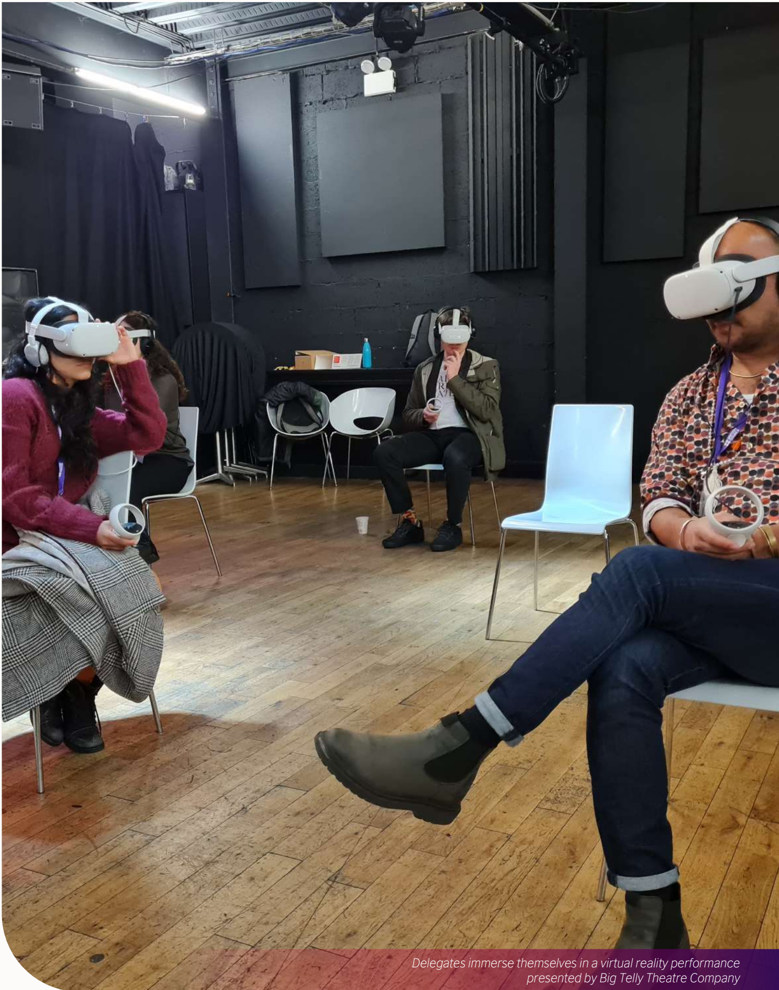
Delegates immerse themselves in a virtual reality performance presented by Big Telly Theatre Company