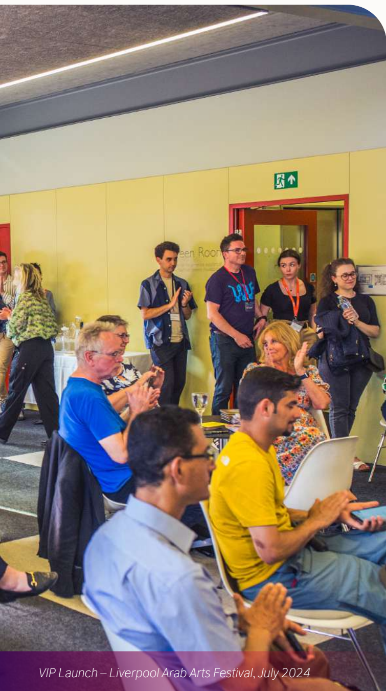
VIP Launch – Liverpool Arab Arts Festival, July 2024

The Port Cities project, launched in partnership with the Liverpool Arab Arts Festival (LAAF), is an ambitious initiative exploring the shared histories, contemporary realities, and imagined futures of port cities across the world. At the heart of the project is a critical dialogue that connects Liverpool – a city with a deeply intertwined history of trade, migration, and cultural exchange – with major Arab port cities, including Beirut, Casablanca, Tunis, and Cairo. This initiative reflects on the socio-economic, cultural, and environmental dynamics of these urban hubs through the lens of multidisciplinary art.